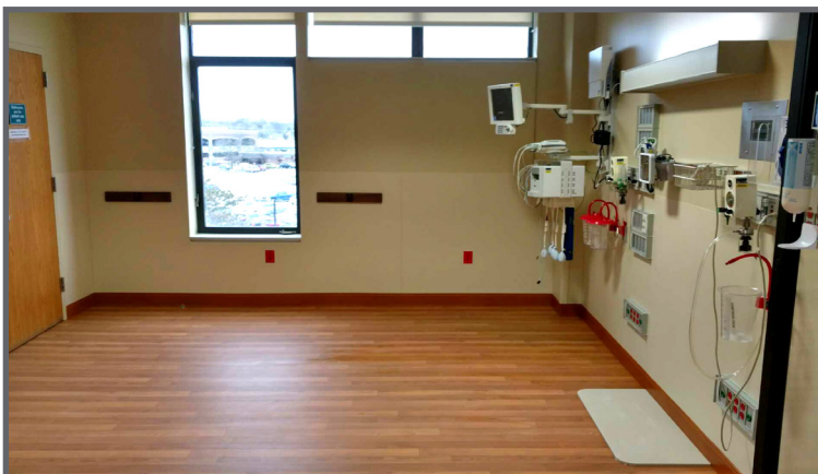
The Finished Work

Stenco's attention to detail on all aspects of the job ensured that St. Mary Mercy's renovations were finished on time, exceeded expectations, and kept patients safe. Near the completion of this project, St. Mary Mercy was awarded an "A" for patient safety from Leapfrog Hospital Safety Grades. This award recognizes the hospital as being among the safest in the United States – an honor that Stenco is proud to have supported and enhanced with our renovation work on their patient care facilities.