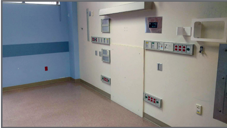
The Starting Point - Pre-Renovation

W hen it comes to patient safety, St. Mary Mercy Hospital in Livonia doesn't compromise. Consequently, when it came time to renovate 16 of their Intensive Care Unit (ICU) patient rooms, they trusted Stenco to upgrade their facilities to safer and cleaner rooms without unduly interrupting their day to day operations.